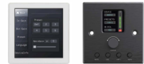
Wall Control Panel